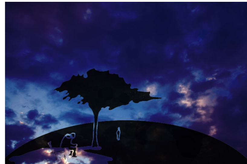
9. Late night